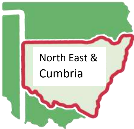
North East & Cumbria

This plan is especially about a good life for people with Learning Disabilities who have autism, mental health needs or behaviour that challenges